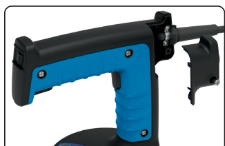
Dual-trigger handle and serviceable cord design