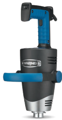
WSBPPX Heavy-Duty Big Stix® EvolutionX® Power Pack