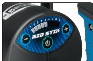
Electronic speed adjustment with LED indicator