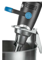
WSBBC Big Stix® EvolutionX® Immersion Blender Bowl Clamp