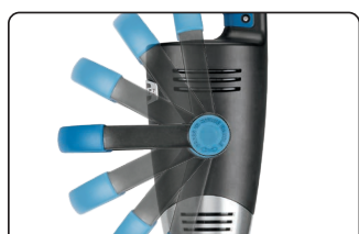
Patented pivoting second handle and comfort grip