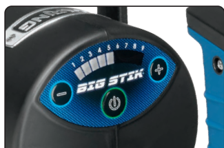
Electronic speed adjustment with LED indicator