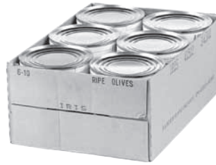
For #10 Can Cases