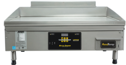
GGF-A36 AccuSteam™ Tabletop Griddle shown