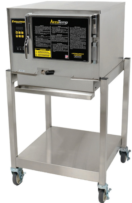
N3 Evolution™ model shown on stand with casters

Evolution™ steamer is AccuTemp Products' gas, connected, boiler-free steamer that utilizes AccuTemp's patented Steam Vector Technology™ for faster cook times, improved energy efficiency, better pan-to-pan uniformity, and less water consumption. Steam Vector Technology utilizes no moving parts inside the cooking chamber. Steam is produced inside the cooking cavity with no heating element exposed to water. Certified holding cabinet. Steamer is powered by a heavy duty stainless steel power burner. Easily connects to water, drain and gas lines. Uses less than 1 gallon of water per hour. Steamer includes low water, high water, over-temp warning lights, and auto shut off feature. Evolution includes heavy duty, one-piece field reversible door. Standard digital controls with independent timer. No water quality exclusions to warranty and no water filtration or treatment required. Lifetime Service & Support Guarantee. Steamer is UL Safety and Sanitation Certified, and ENERGY STAR® qualified. Made in the USA.