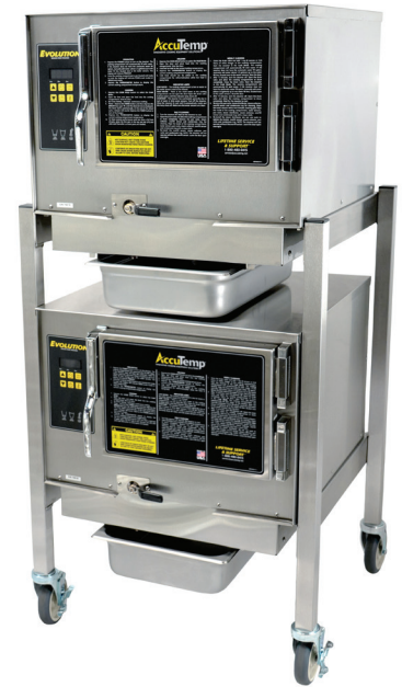
N3 Evolution™ models shown double-stacked on stand with optional casters and drain pans

Evolution™ steamer is AccuTemp Products' gas, connectionless, boiler-free steamer that utilizes AccuTemp's patented Steam Vector Technology™ for faster cook times, improved energy efficiency, better pan to pan uniformity, and less water consumption. Steam Vector Technology utilizes no moving parts inside the cooking chamber. Steam is produced inside the cooking cavity with no heating components exposed to water. Certified holding cabinet. Steamer is powered by a heavy duty stainless steel power burner. Uses less than 1 gallon of water per hour. Steamer includes low water, high water, over-temp warning lights, and auto shut off feature. Evolution includes heavy duty, one-piece field reversible door. Standard digital controls with independent timer. No water quality exclusions to warranty and no water filtration or treatment required. Lifetime Service & Support Guarantee. Steamer is UL Safety and Sanitation Certified, and ENERGY STAR® qualified. Made in the USA.