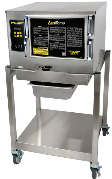
N3 Evolution™ model shown on stand with optional casters and drain pan

Evolution™ steamer is AccuTemp Products' gas, connectionless, boiler-free steamer that utilizes AccuTemp's patented Steam Vector Technology™ for faster cook times, improved energy efficiency, better pan to pan uniformity, and less water consumption. Steam Vector Technology utilizes no moving parts inside the cooking chamber. Steam is produced inside the cooking cavity with no heating components exposed to water. Certified holding cabinet. Steamer is powered by a heavy duty stainless steel power burner. Uses less than 1 gallon of water per hour. Steamer includes low water, high water, over-temp warning lights, and auto shut off feature. Evolution includes heavy duty, one-piece field reversible door. Standard digital controls with independent timer. No water quality exclusions to warranty and no water filtration or treatment required. Lifetime Service & Support Guarantee. Steamer is UL Safety and Sanitation Certified, and ENERGY STAR® qualified. Made in the USA.