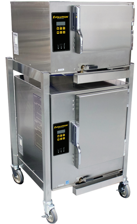
E3 Evolution™ model shown stacked with E6 Evolution™ model on stand with casters

Evolution™ steamer is AccuTemp Products' electric, connected, boiler-free steamer that utilizes AccuTemp's patented Steam Vector Technology™ for faster cook times, improved energy efficiency, better pan-to-pan uniformity, and less water consumption. Steam Vector Technology utilizes no moving parts inside the cooking chamber. Steam is produced inside the cooking cavity with no heating element exposed to water. Certified holding cabinet. Easily connects to water and drain line. Uses less than 1 gallon of water per hour. Steamer includes low water, high water, over-temp warning lights and auto shut off feature. Evolution includes heavy duty, one-piece field reversible door. Standard digital controls with independent timer. No water quality exclusions in warranty. No water filtration or treatment required. Lifetime Service & Support Guarantee. Steamer is UL Safety and Sanitation Certified, and ENERGY STAR® qualified. Made in the USA.