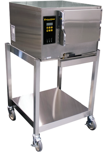
E3 Evolution™ model shown on stand with casters

Evolution™ steamer is AccuTemp Products' electric, connected, boiler-free steamer that utilizes AccuTemp's patented Steam Vector Technology™ for faster cook times, improved energy efficiency, better pan-to-pan uniformity, and less water consumption. Steam Vector Technology utilizes no moving parts inside the cooking chamber. Steam is produced inside the cooking cavity with no heating element exposed to water. Certified holding cabinet. Easily connects to water and drain line. Uses less than 1 gallon of water per hour. Steamer includes low water, high water, over-temp warning lights and auto shut off feature. Evolution includes heavy duty, one-piece field reversible door. Standard digital controls with independent timer. No water quality exclusions in warranty. No water filtration or treatment required. Lifetime Service & Support Guarantee. Steamer is UL Safety and Sanitation Certified, and ENERGY STAR® qualified. Made in the USA.