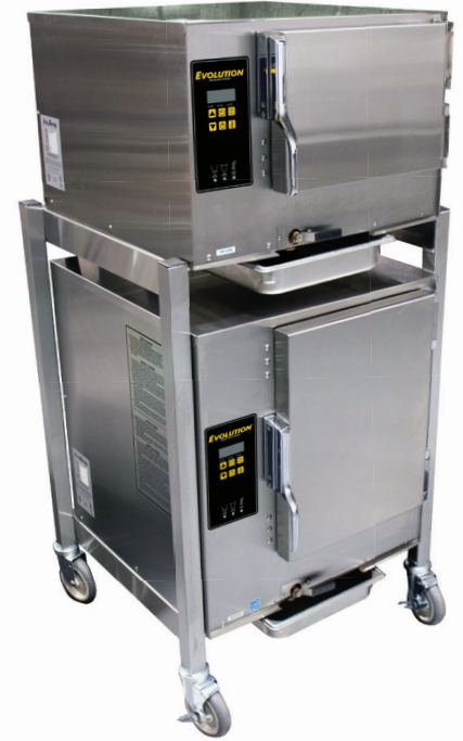
E3 Evolution™ model shown stacked with E6 Evolution™ model on stand with optional casters and drain pans

Evolution™ steamer is AccuTemp Products' electric, connectionless, boiler-free steamer that utilizes AccuTemp's patented Steam Vector Technology™ for faster cook times, improved energy efficiency, and better pan-to-pan uniformity. Steam Vector Technology utilizes no moving parts inside the cooking chamber. Steam is produced inside the cooking cavity with no heating element exposed to water. Certified holding cabinet. No water or drain line. Steamer includes low water, high water, over-temp warning lights and auto shut off feature. Evolution includes heavy duty, one-piece field reversible door. Standard digital controls with independent timer. No water quality exclusions in warranty. No water filtration or treatment required. Lifetime Service & Support Guarantee. Steamer is UL Safety and Sanitation Certified, and ENERGY STAR® qualified. Made in the USA.