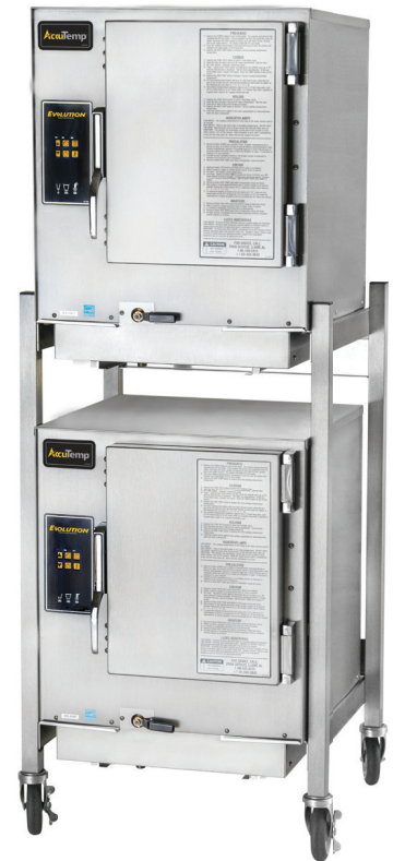
N6 Evolution™ models shown double-stacked on stand with casters

Evolution™ steamer is AccuTemp Products' gas, connected, boiler-free steamer that utilizes AccuTemp's patented Steam Vector Technology™ for faster cook times, improved energy efficiency, better pan-to-pan uniformity, and less water consumption. Steam Vector Technology utilizes no moving parts inside the cooking chamber. Steam is produced inside the cooking cavity with no heating element exposed to water. Certified holding cabinet. Steamer is powered by a heavy duty stainless steel power burner. Easily connects to water, drain and gas lines. Uses less than 1 gallon of water per hour. Steamer includes low water, high water, over-temp warning lights, and auto shut off feature. Evolution includes heavy duty, one-piece field reversible door. Standard digital controls with independent timer. No water quality exclusions to warranty and no water filtration or treatment required. Lifetime Service & Support Guarantee. Steamer is UL Safety and Sanitation Certified, and ENERGY STAR® qualified. Made in the USA.