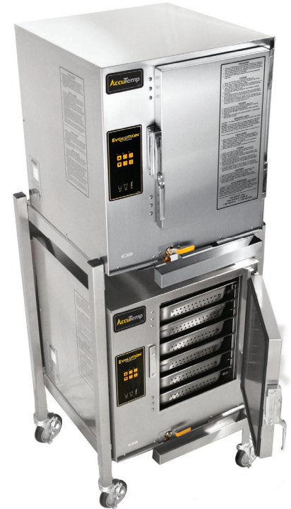
E6 Evolution™ models shown double-stacked on stand with casters

Evolution™ steamer is AccuTemp Products' electric, connected, boiler-free steamer that utilizes AccuTemp's patented Steam Vector Technology™ for faster cook times, improved energy efficiency, better pan-to-pan uniformity, and less water consumption. Steam Vector Technology utilizes no moving parts inside the cooking chamber. Steam is produced inside the cooking cavity with no heating element exposed to water. Certified holding cabinet. Easily connects to water and drain line. Uses less than 1 gallon of water per hour. Steamer includes low water, high water, over-temp warning lights and auto shut off feature. Evolution includes heavy duty, one-piece field reversible door. Standard digital controls with independent timer. No water quality exclusions in warranty. No water filtration or treatment required. Lifetime Service & Support Guarantee. Steamer is UL Safety and Sanitation Certified, and ENERGY STAR® qualified. Made in the USA.