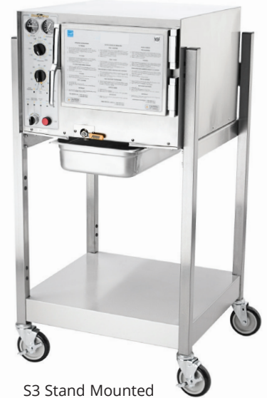
S3 Stand Mounted Steam&Hold™ Steam Cooker