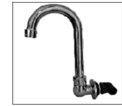
Faucet : AA-515G