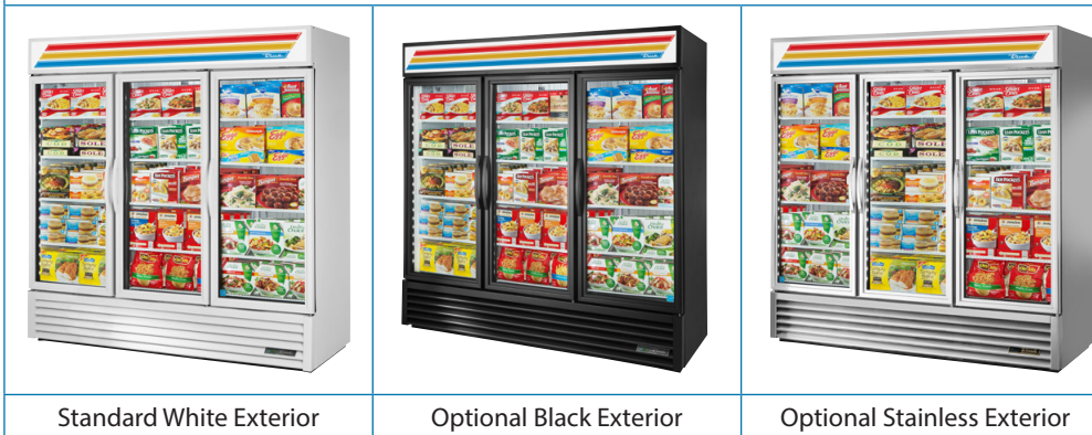
Standard White Exterior