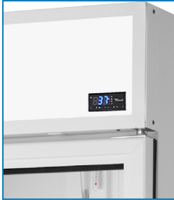
Standard: Display in sign frame.

Swing Door Scientific Refrigerator with Hydrocarbon Refrigerant~True Standard Look Version 01