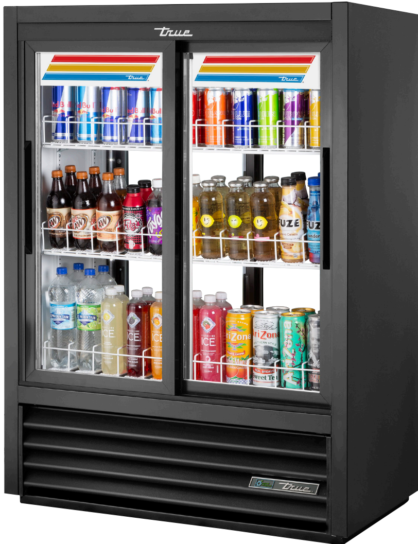
Shown with optional TrueTrac bottle organizers.

Slide Door Lower Height Narrow Depth Fast Lane Pass-Thru Refrigerator with Hydrocarbon Refrigerant and LED Lighting