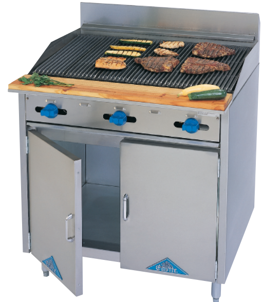
Model F33-3RB (shown with optional doors & cutting board)