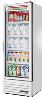
Optional White Exterior