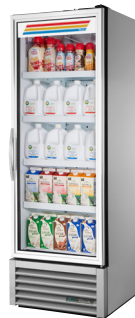
Optional Stainless Exterior