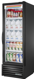
Standard Black Exterior