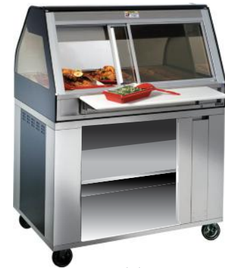
Mobile Base (Standard Height)