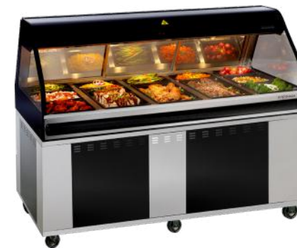
Mobile Base (Standard Height)