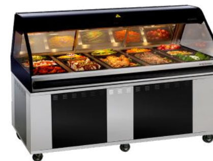
Mobile Base (Short Height)