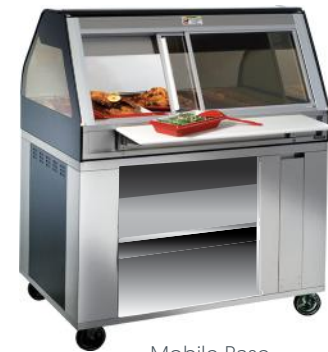
Mobile Base (Short Height)