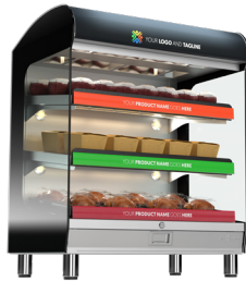
HSM-36/3S/T Shown with custom graphics.