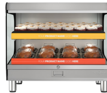
HSM-36/2S/T/F Shown with custom graphics.