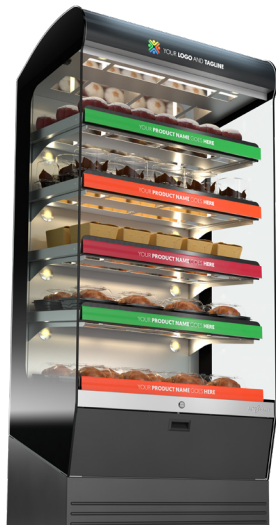
HSM-36/5S/T Shown with custom graphics.