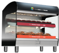
HSM-36/2S/T Shown with custom graphics.